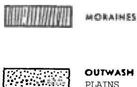
Fig. 2. Map of Long Island, showing region of moraine and outwash plains. From Dorothy Sterling, The Outer Lands, a Natural History Guide to Cape Cod, Martha's Vineyard, Nantucket, Block Island, and Long Island , (Garden City, N.Y., 1967).