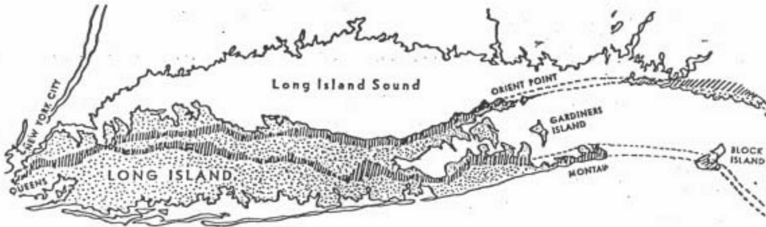
The Outer Lands

is composed of Miami stony loam, a thick soil presenting a rounded, knobby appearance and extending ten to twenty feet deep. The surface of the loam is strewn with large boulders of gneiss, granite, quartzite, shale, and conglomerate. South of the moraine region is a plateau formed by the glacial outwash carrying particulate material as the glacier melted and retreated. The soil is a Sassafras gravelly loam formed by thorough mixing of gravel with fine silt and clay during the late Pleistocene era. It is a soil which provides favorable conditions for the pitch pine ( Pinus rigida )-scrub oak ( Quercus ilicifolia ) forests which grow there. (Bonsteel, 1903). (See Fig. 2.)