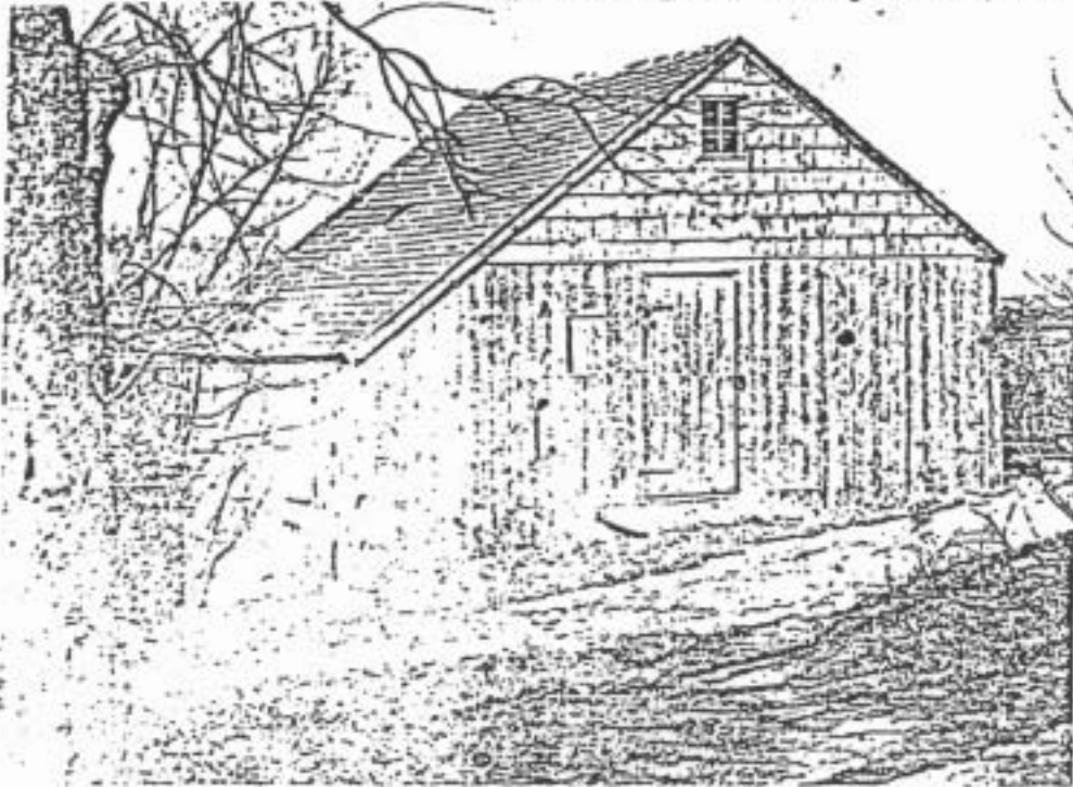
Fig. 3. Wooley's Saw Mill was in operation from 1710 on the original Woodhull patent, along the west branch of The Wading River. Picture taken circa 1900.

erected on this site and began operating as early as 1710. (See Fig. 3.)