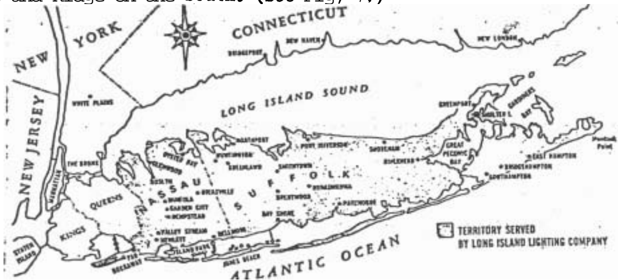
Fig.1. Map of Long Island, showing Shoreham. From LILCO Final Environmental Statement related to Operation of Shoreham Nuclear Power Station, Docket #50-32, U.S. Atomic Energy Commission Directorate of Licensing.

Shoreham is a residential hamlet within the Town of Brookhaven comprised of an incorporated village, Shoreham Village , and an unincorporated area surrounding the village.. It is located 65 miles east of New York City on the north shore of Long Island and is bordered by Rocky Point on the west, Long Island Sound on the north, Wading River on the east, and Ridge on the south. (See Fig, 1.)