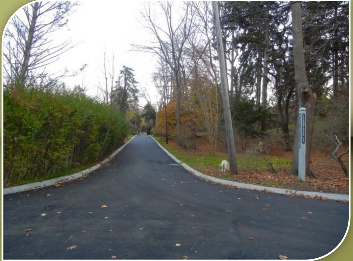
wardencliff at Thompson, looking south (area of stormwater runoff flooding on left)