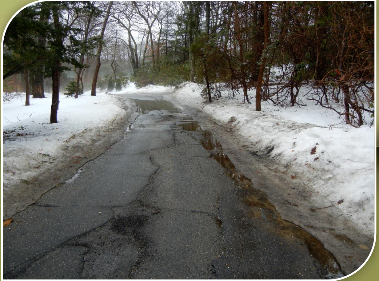
Beatty near Overhill (looking southwest)